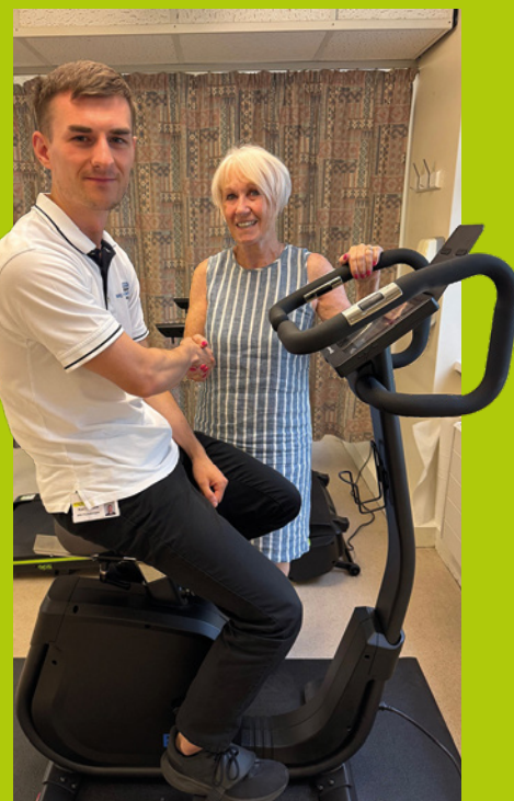
Physio bike presentation